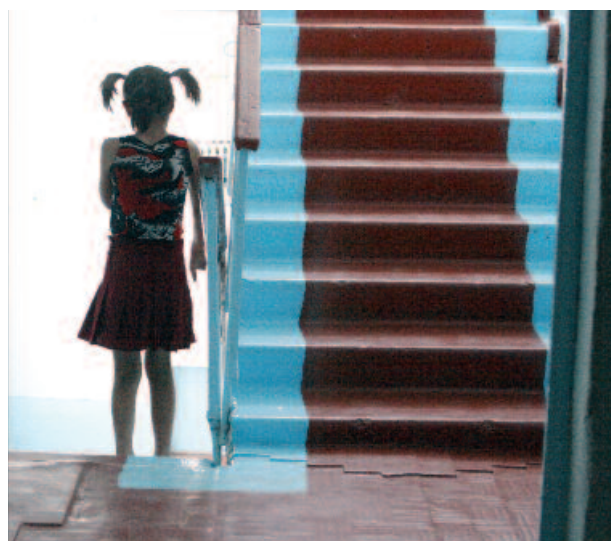
A girl in a Soviet-era residential institution in Kyrgyzstan. There are at least 8 million children in institutional care worldwide.

The continued use of institutions is expensive, much more so than other forms of care, and therefore uses up a great deal of resources that could be better spent on prevention or developing family-based alternatives. Institutional care is six to 100 times more expensive than family or community-based